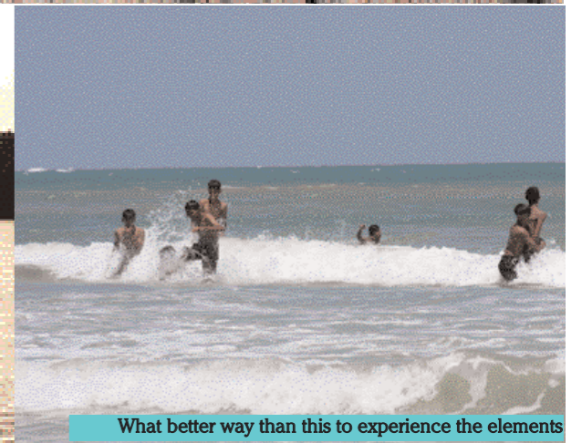
What better way than this to experience the elements