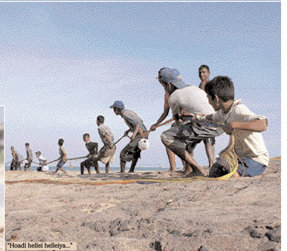
"Hoadi hellei helleya..."