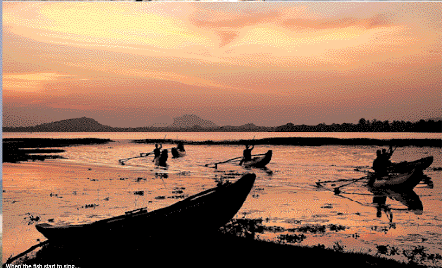
When the fish start to sing....