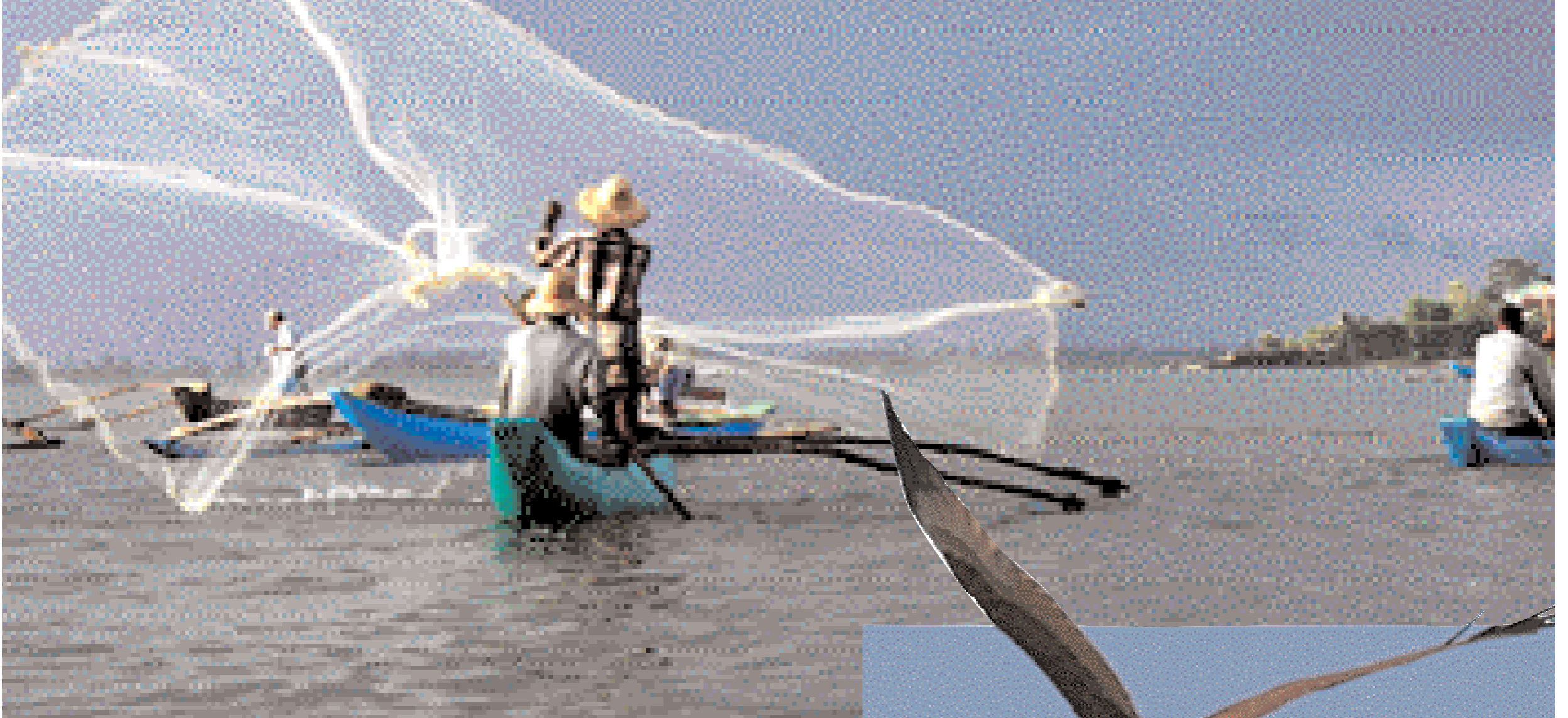
Good luck with the catch

Ever heard the fish singing under the bridge in Batticaloa? If you listen hard, very hard you will hear them sing "Lady in red..." They would sing it staring at the sky which looks as though a lady wearing a red skirt had swirled by on her lover's arms.