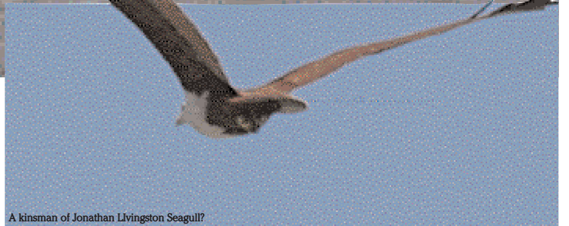
A kinsman of Jonathan Livingston Seagull?