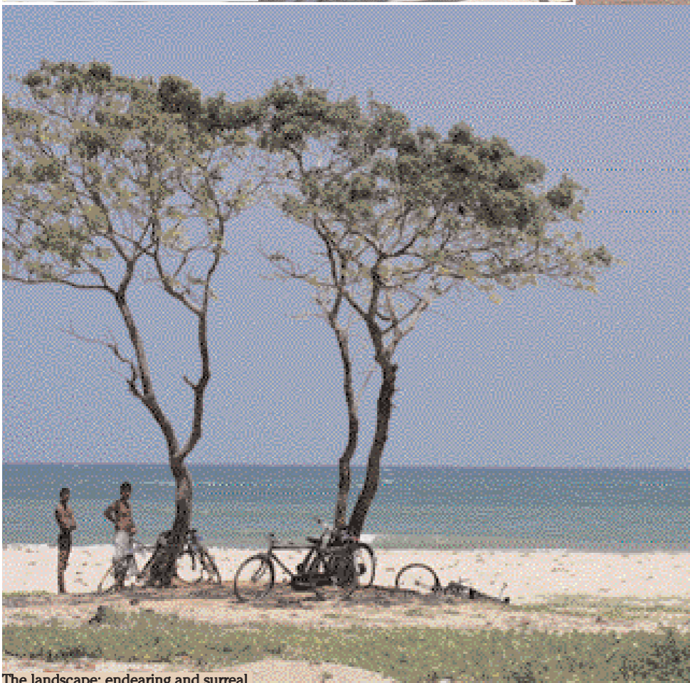
The landscape: endearing and surreal