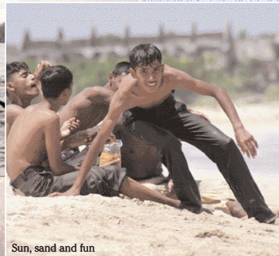
Sun, sand and fun