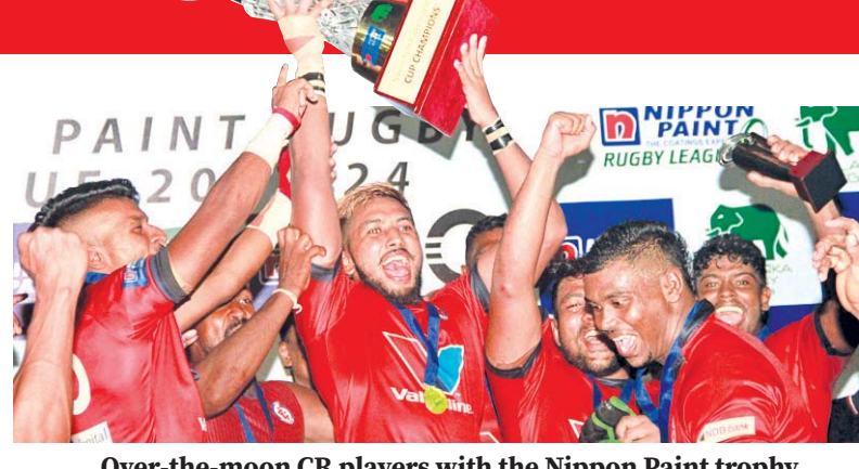
Over-the-moon CR players with the Nippon Paint trophy