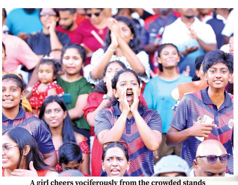
A girl cheers vociferously from the crowded stands