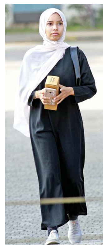
A young rugby fan walks in to take her seat at the Race Course ground in Colombo