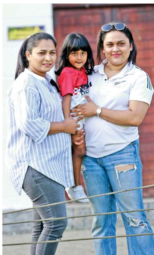
The youngest fan at the CR-CH game had the privilege of a hosited view of the action