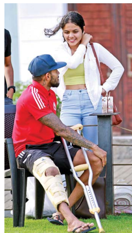
A rugby fan talks to an unidentified player recovering from injury who seems to be missing being part of the action

Nothing like cool comfortable headgear for a CH supporter before kick-off