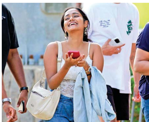
A rugby fan laughs at a joke