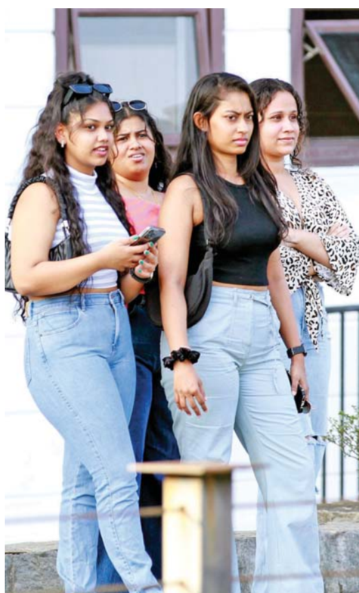
Facial expressions during tense moments of the match