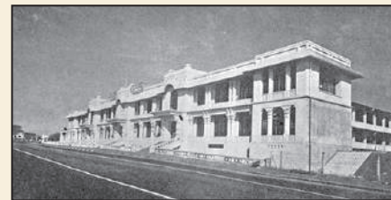
The Associate Newspapers of Ceylon Limited, ANCL (Lake House)

Source: 'The life and times of D.R. Wijewardene'