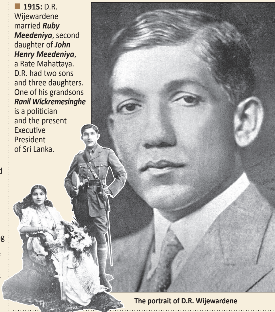
The portrait of D.R. Wijewardene