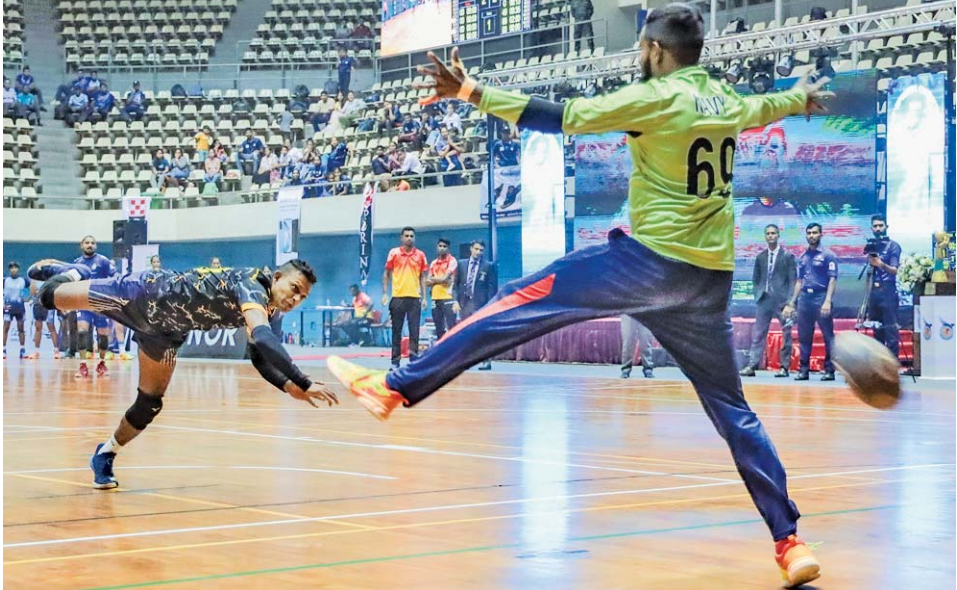
Army's Ras Kumara lands in a goal past the Navy goal keeper